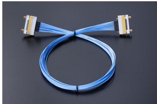
16 channels Customized product