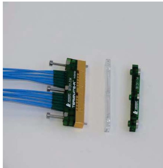
Figure 2: Protective Bottom Cover and Stiffener Block Removed from the TR Assembly